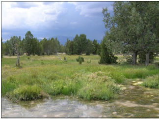
Near the Shoshone Pond Natural Area of the BLM

Newe, Nevada's Native peoples were hunters and gatherers and roamed in small familial groups in their search for sustenance. This forest of junipers was centrally located, providing shade during hot summers and became the favorite gathering place for the Newe. Ample water-enabled plant and wildlife proliferated. Many game birds and animals, rare medicinal plants, pinion forests with their ample bounty of nuts were near and fish thrived in the nearby streams and ponds. The "Cedars" became a Sacred Ceremonial site, friendships were renewed, young people found mates, sacred ceremonies were performed and food and medicinal stores replenished prior to snowfall.