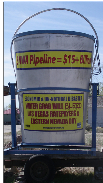
Giant water bucket in Baker, Nev., on the road to Great Basin National Park, sports a new sign. The message? The Water Grab is a disaster for Las Vegas ratepayers and Eastern Nevadans.