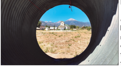
Thanks to Nevada Rangeland Resource Commission for new signs for the 84" diameter pipe in Baker. View from inside.

hen we last wrote to you in the Water Gab, we alerted you to the dangers of Nevada Assembly Bill 298 at the Nevada Legislature, which would have rewritten a century of water law retroactively to weaken senior water rights and open loopholes for groundwater mining under the guise of "clarifying" a process for Monitoring, Management, and Mitigation (3M) Plans. Thankfully, a broad group of community members, organizations, local governments, business interests and tribes made their voices heard - the bill was among the top 50 most commented on, with only 3 of the 343 opinions in support. As a result, a bipartisan group of Senators decided to abandon this flawed and controversial bill. While there was talk of reviving the language in a different bill, that effort never came to fruition thanks in part to everybody's continued vigilance.