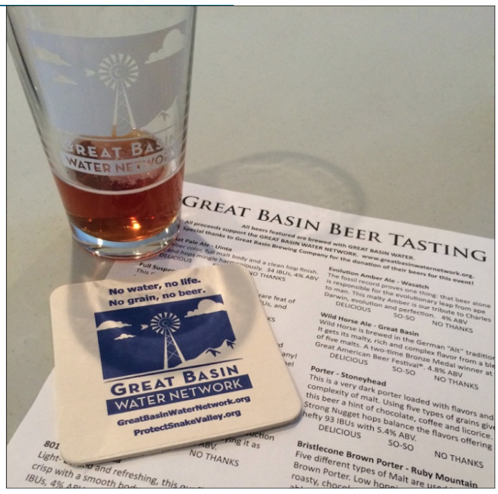
No Water, No Life; No Grain, No Beer: The Coaster was introduced at the Great Basin Beer Tasting and is seen throughout Snake Valley and beyond, under beverages of all kinds.