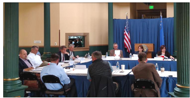
Drought Forum committee discusses changes to its draft report which was not available to the public prior to the meeting.

The report summarizes current and planned actions for water conservation, changes to Nevada water law, monitoring and research data, financial and technical assistance, supply augmentation and long range planning, and information sharing and public outreach. Several people considered this last suggestion the most important. How does the Governor set the