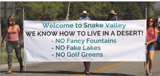
It was a banner year for the 10th Snake Valley Water Festival parade on the Saturday of Labor Day weekend. For more Festival pix, see page 7. The Festival is a community event to raise money for GBWN to continue the water fight.

The ruling, however, was a complicated one. In the course of denying SNWA’s water rights applications, the State Engineer still approved SNWA’s clearly deficient monitoring, management, and mitigation plans, which he held could be implemented at some point in the future if the rest of the ruling is reversed and SNWA is able to obtain water rights for its project. The State Engineer also indicated an intent to appeal his own Ruling on the ground that he disagrees with the courts’ interpretation of Nevada water law and believes that the law should be interpreted