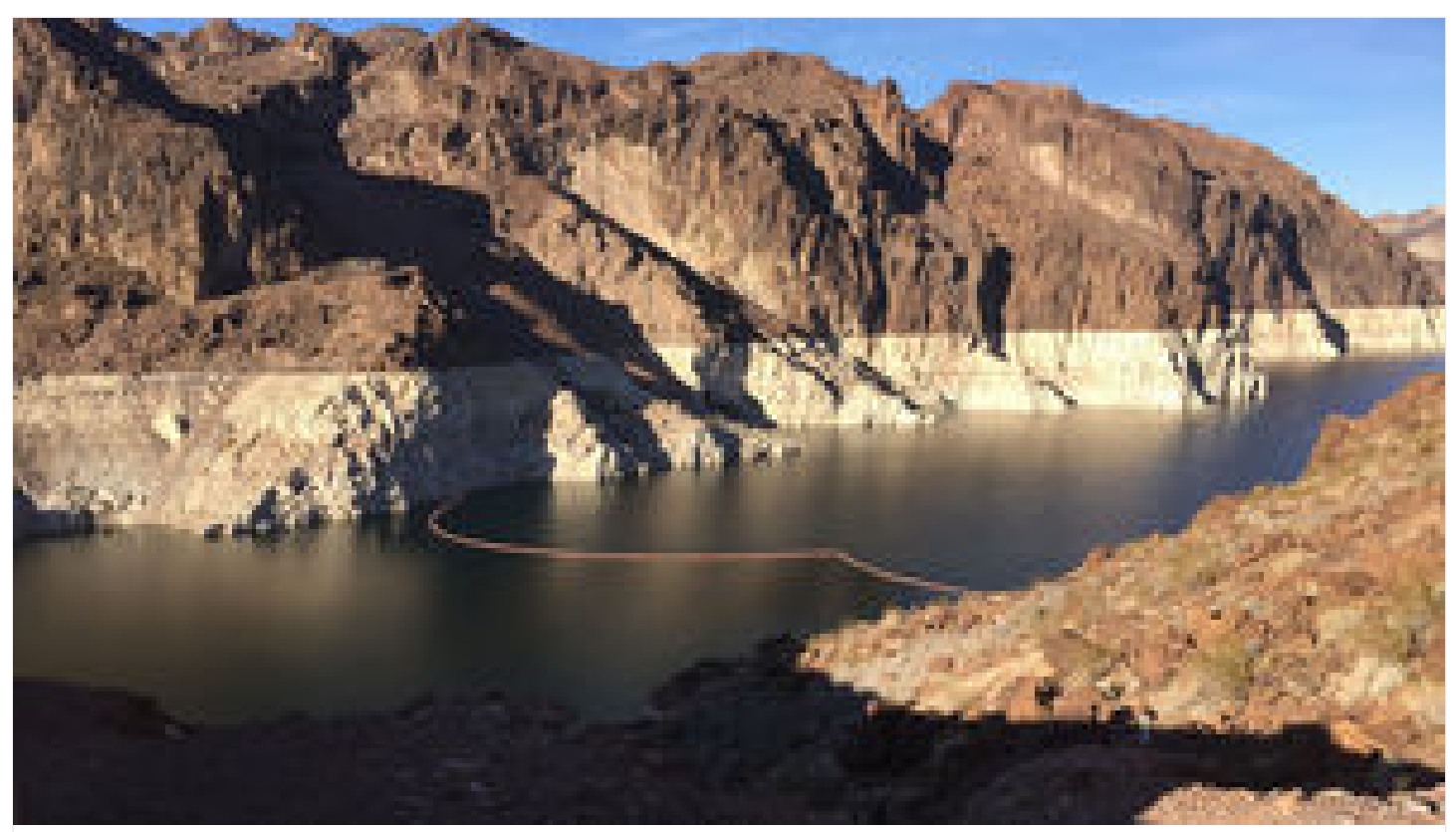
Feds: Fix Colorado River problems or we will