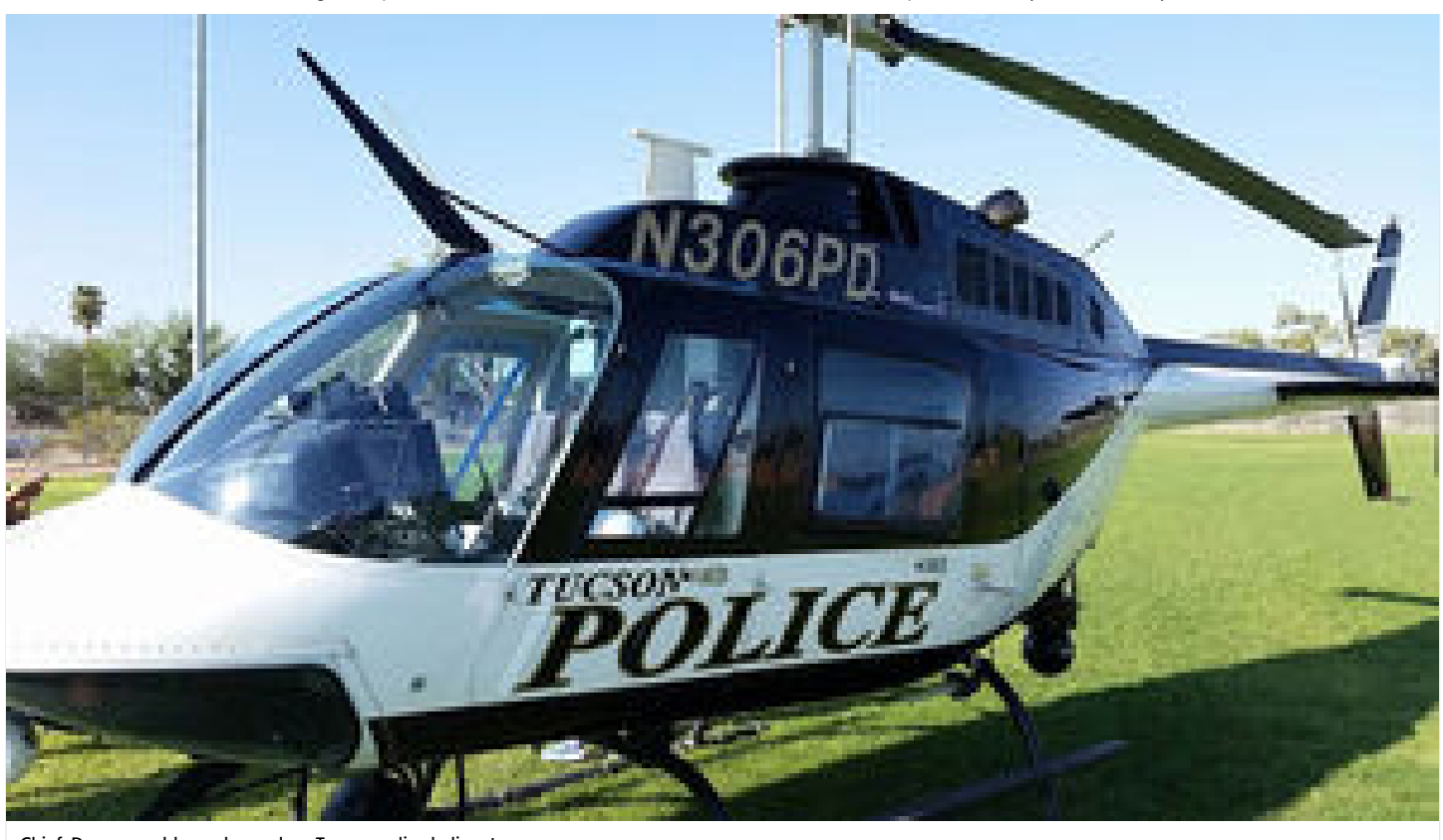
Chief: Drones could one day replace Tucson police helicopters