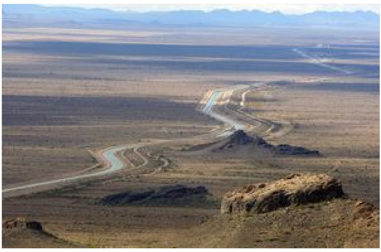
Is California trying to take our water?