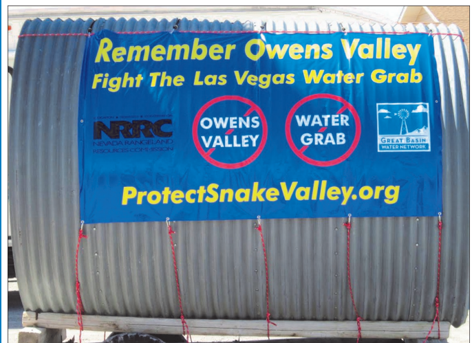
The Pipe signs were worn from wind and weather. Thanks to Nevada Rangeland Resources Commission for including sign replacement funds in our grant.