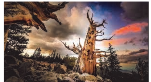
Kelly Carroll's Bristlecone Pine at Sunset photo canvas, a premier silent auction item.

Saturday begin with breakfast at Kerouac's Café in downtown Baker. The town parade, with a water theme, will start at 10 am and complete its circuit twice, lest any spectators blink and miss it. The day will continue with a community yard sale, food and craft booths, a book sale, a silent auction, bake sale, live music, kids' games, and a massive water fight. The day will culminate with a BBQ dinner and dance at the Border Inn. —Jenny Hamilton