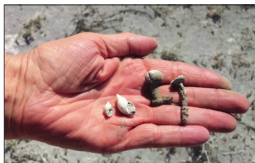
Denys Koyle holds shells and mushrooms, the only evidence of a large "freight lake," once used as a water source by travelers through Snake Valley.