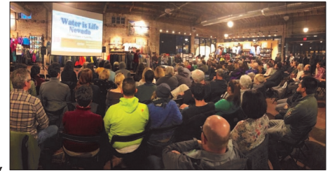
Patagonia hosted the SRO Reno screening of Water Is Life films by PLAN and GBWN.