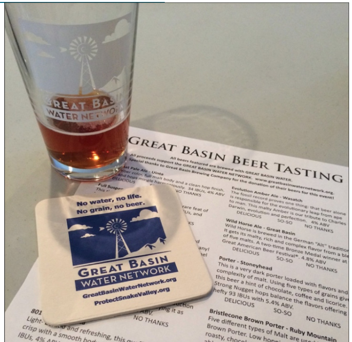
No Water, No Life; No Grain, No Beer: The Coaster was introduced at the Great Basin Beer Tasting and is seen throughout Snake Valley and beyond, under beverages of all kinds.