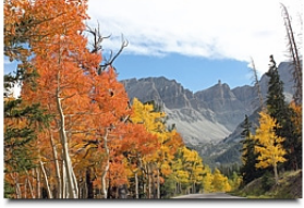
2016 Snake Valley Calendar

YOUR CONTRIBUTION TO GBWN IS MORE THAN A DROP IN THE BUCKET.