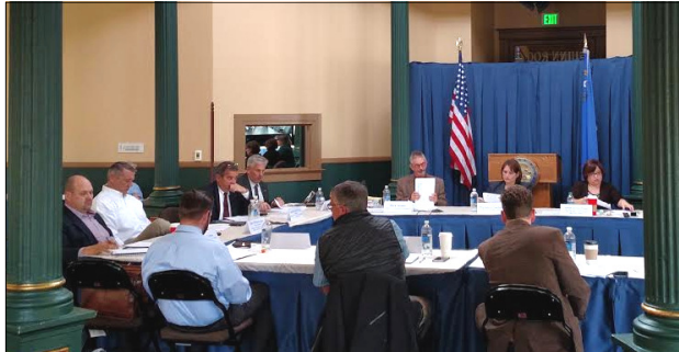
Drought Forum committee discusses changes to its draft report which was not available to the public prior to the meeting.

The report summarizes current and planned actions for water conservation, changes to Nevada water law, monitoring and research data, financial and technical assistance, supply augmentation and long range planning, and information sharing and public outreach. Several people considered this last suggestion the most important. How does the Governor set the