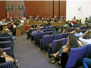
Nevada State Engineer will hold hearings in the Fall of 2011 on SNWA's 1989 water applications in four valleys in White Pine and Lincoln Counties