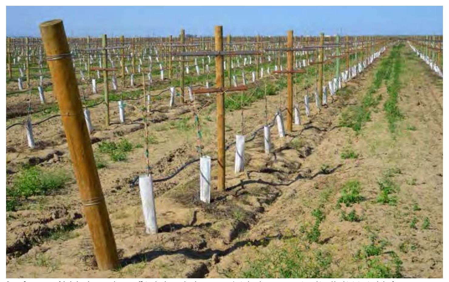
Some farmers use drip irrigation to apply water efficiently, close to the plant root zone. Agricultural water conservation achieved by drip irrigation helps farmers save water, but implementation of drip should account for local hydrological conditions.

Las Vegas and Los Angeles—are encouraging residents to reduce water use by offering rebates for turf removal in favor of less-thirsty landscaping. Utilities are also showing customers how much water they use in comparison to their neighbors through easy-to-interpret graphical information on bills and smart phone apps.