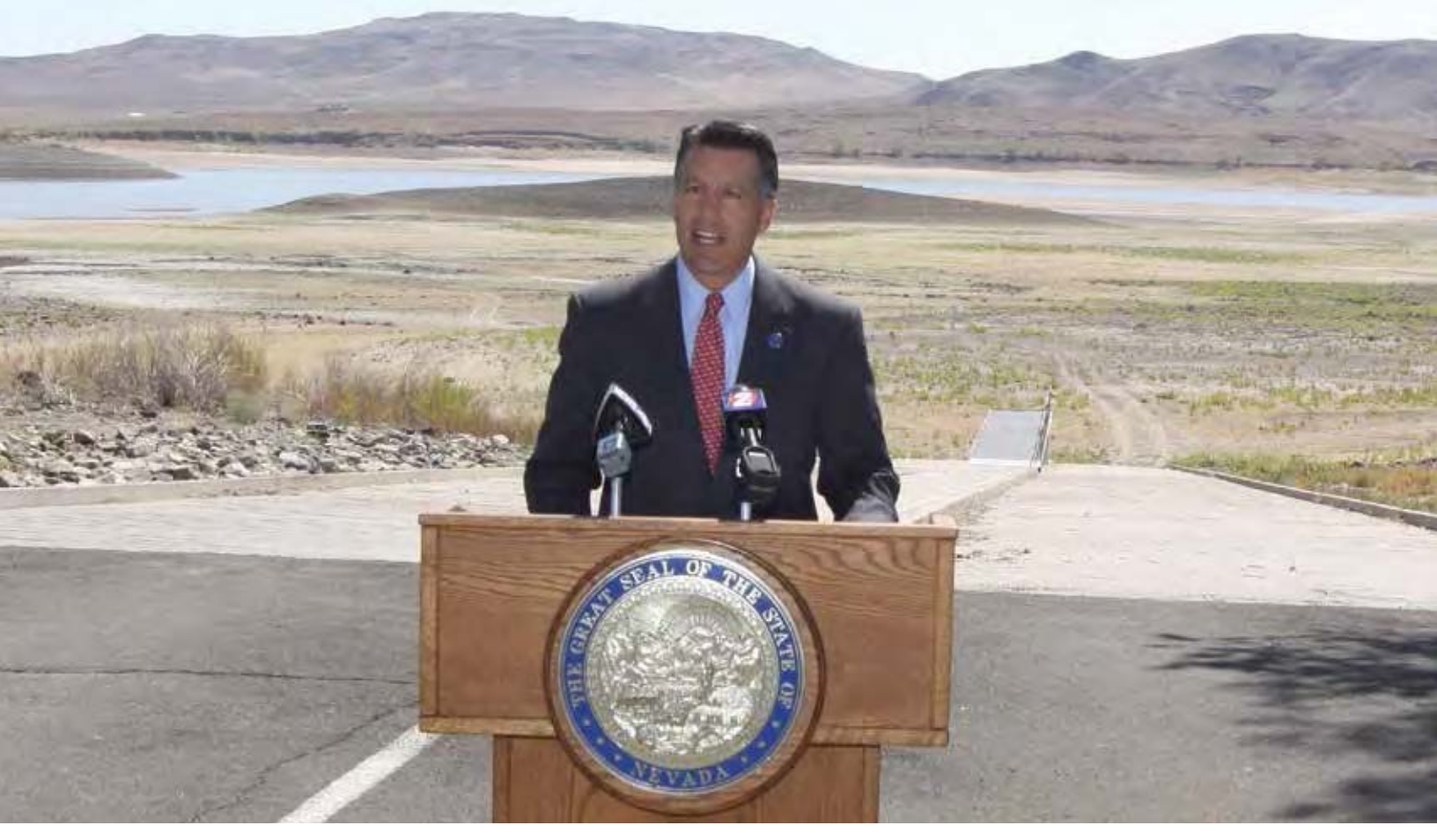
Nevada Gov. Brian Sandoval announced the creation of the Western Governors' Drought Forum on the boat ramp of the Lahontan Reservoir in northern Nevada, which suffered from exceptionally low water levels in 2014 due to drought.