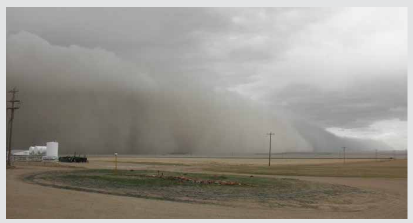
Drought is a contributing factor to dust storms such as this 2013 storm in southeastern Colorado.