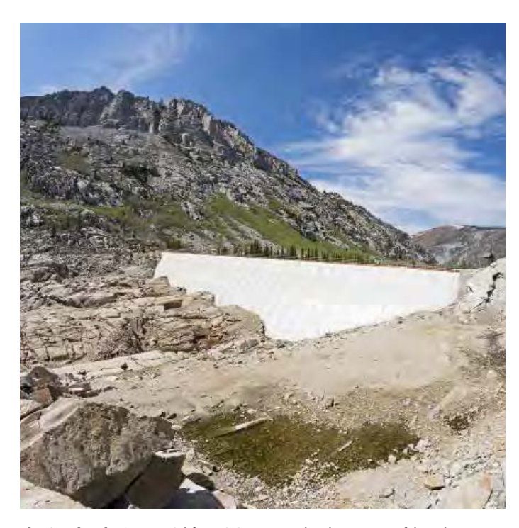
The South Lake Dam in California's Sierra Nevadas shows signs of drought conditions affecting many states in the west.

For urban water users, the sting of drought in past decades has been softened by water storage and water providers who have proactively planned to ensure reliable supplies. The severity of the multiyear drought in California removed that cushion for some, such as citizens of